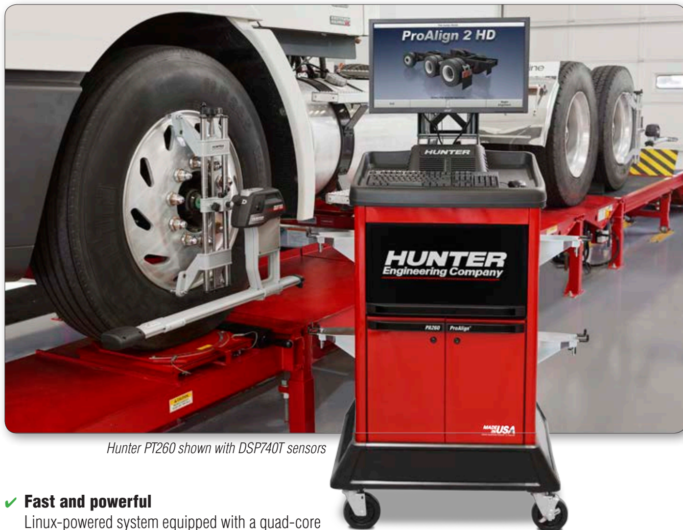
Hunter PT260 shown with DSP740T sensors

The Hunter PT200 heavy-duty alignment system using ProAlign® 2 HD software includes the essential features needed to perform fast, accurate alignments.